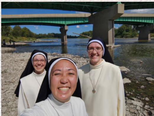
Community outing to Maumee River and local Metro Parks