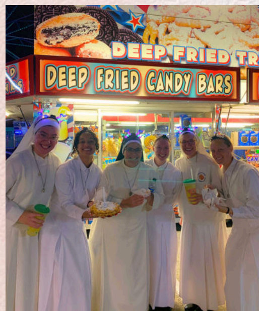
Most Blessed Sacrament Parish Fair adventures with Baton Rouge and Novitiate House Communities