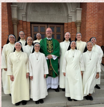
Solemnity of Our Lady of Ransom celebration with Cleveland and Maumee Communities