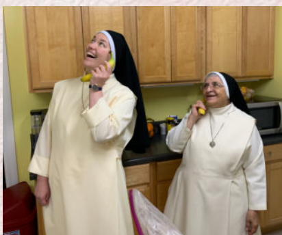
Gainesville Community banana phone fun! "Jesus is calling!"