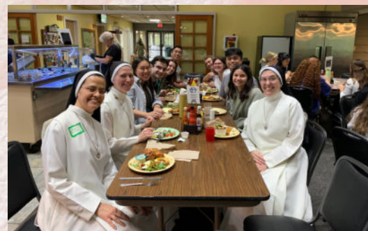
Gainesville Sisters attended the USF Fall Retreat in Tampa