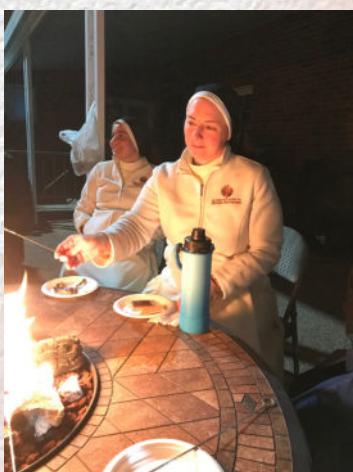
S'mores night in Cleveland!