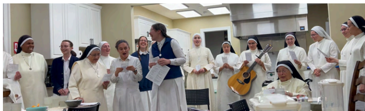
The Novitiate's spaciousness, compared to our other convents, allows it to fulfill Mother Foundress' vision of a "gran casa de familia," where our Sisters can easily gather together.