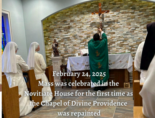
February 24, 2025 Mass was celebrated in the Novitiate House for the first time as the Chapel of Divine Providence was repainted

(Christus Mansionem Benedicat) From the tradition of the Epiphany House Blessing