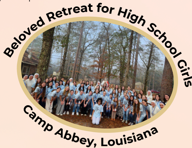
Beloved Retreat for High School Girls Camp Abbey, Louisiana

After hosting a weekend retreat for more than fifty high school girls in February, our Sisters in Baton Rouge were inspired to host a day retreat for college-age women in March.