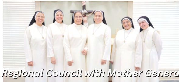
Regional Council with Mother General