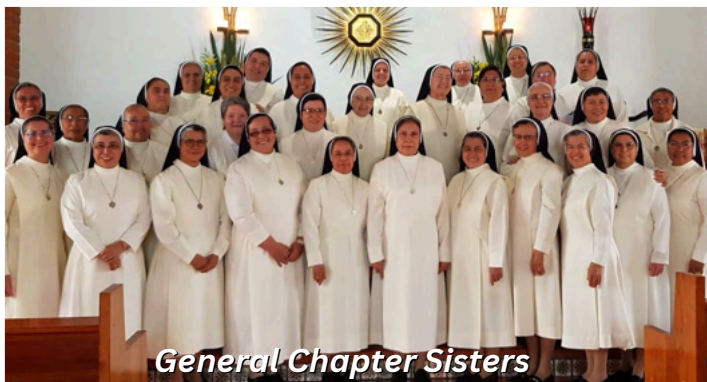
General Chapter Sisters