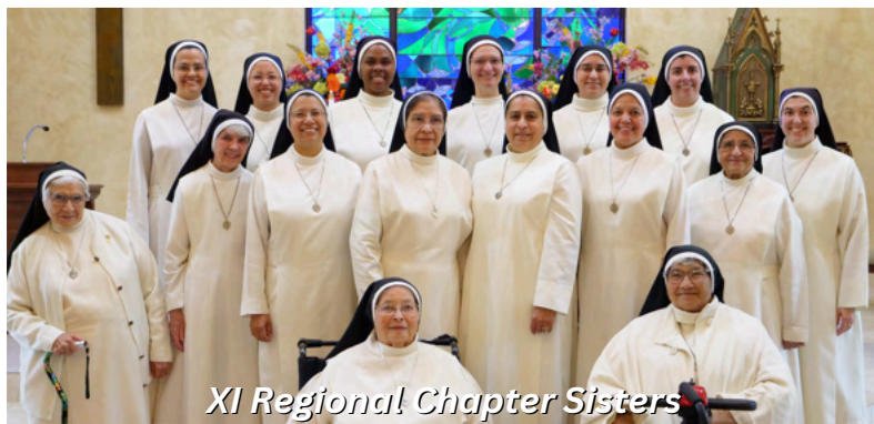
XI Regional Chapter Sisters