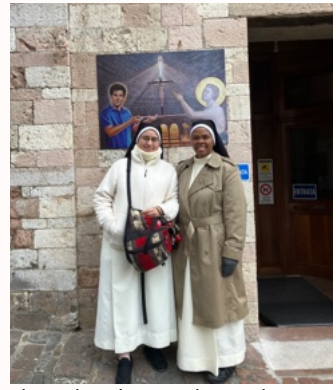
Church where Blessed Carlo Acutis, one of the great Eucharistic Saints, is buried!