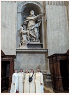
Statue of St. Peter Nolasco, Founder of the Mercedarian Friars, in the Vatican.