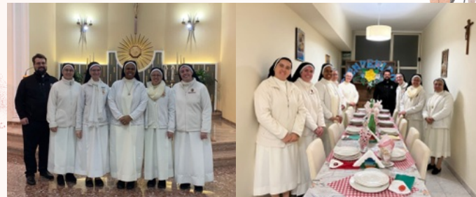
Our USA Sisters visited our Italian Sisters at their convent.

The Scala Sancta, or the Holy Stairs, believed to be the ones Jesus climbed on His way to be condemned.