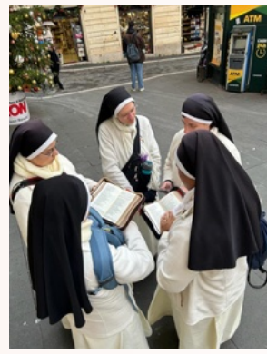
Prayer never ceases! Here are our Sisters praying the Divine Office between holy sites.