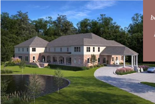
Novitiate House at Cypress Springs Mercedarian Prayer Center The Sister Dulce Foundation, Inc.