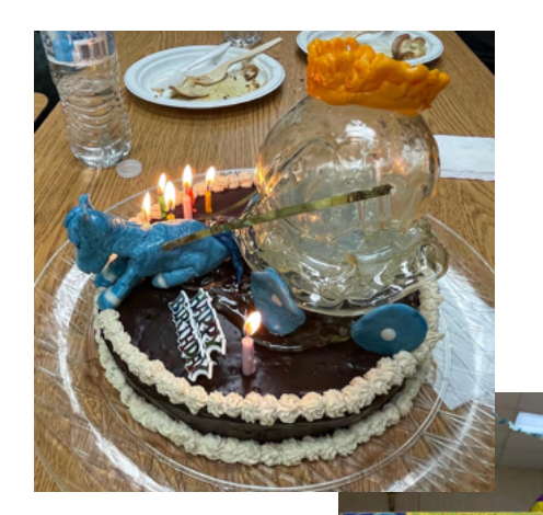
Birthday fun from the Formation House!

"I received this image last Advent as I was praying with our Lady's love for Jesus already in her womb, and her eager, joyful expectation for His arrival and the fulfillment of God's promises. It wasn't until I went on a retreat at Our Lady of Hope retreat center that I realized this image, our Lady pregnant with Jesus in this posture, was called Our Lady of Hope. This meant a lot to me as my middle name is Hope, and I was born in the first week of Advent which is the week of "hope" during the season of awaiting the arrival of Jesus before Christmas."