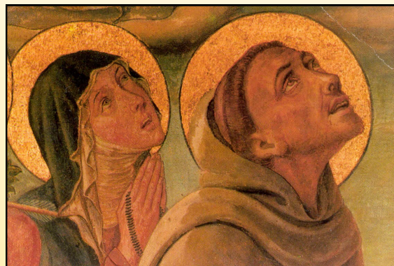
St. Clare and St. Francis from a processional banner from Assisi by Niccolo Alunno (c. 1470)

In my own life, I owe a great deal to the loving support of priestly friendships. When I began to be aware of a possible religious vocation, I ran to my spiritual father for help. This priest not only guided me through the rough waters of discernment, but he and some of my closest friends literally took me to my new home when my parents were unable to! Like a good father, he continues to check up on me, but has since adopted my community as his own family as well. Our Mercedarian brothers have helped me to see why God called me to a Mercedarian community and to strengthen my relationship with our Mother. Also, in